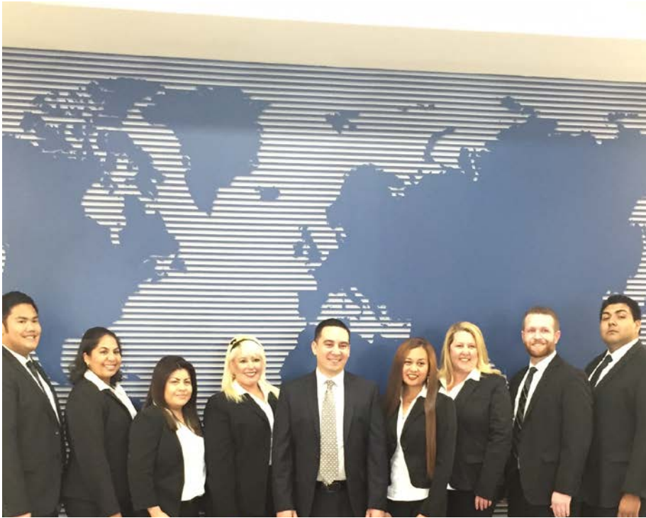
SANTA ANA ROTARY 1959