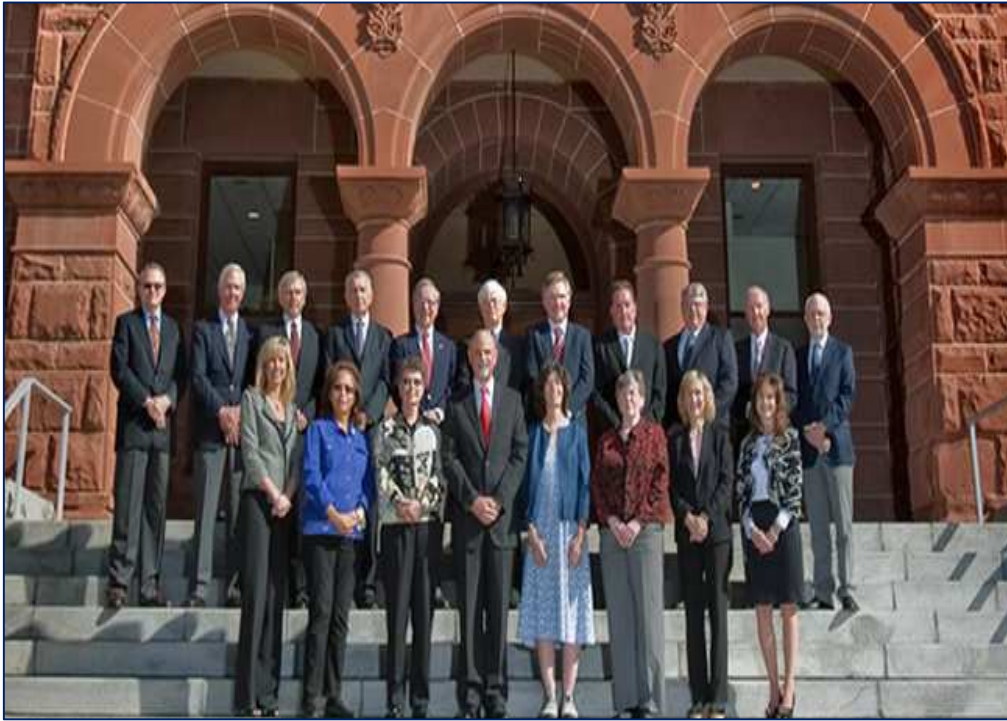
SANTA ANA NORTH ROTARY 1959