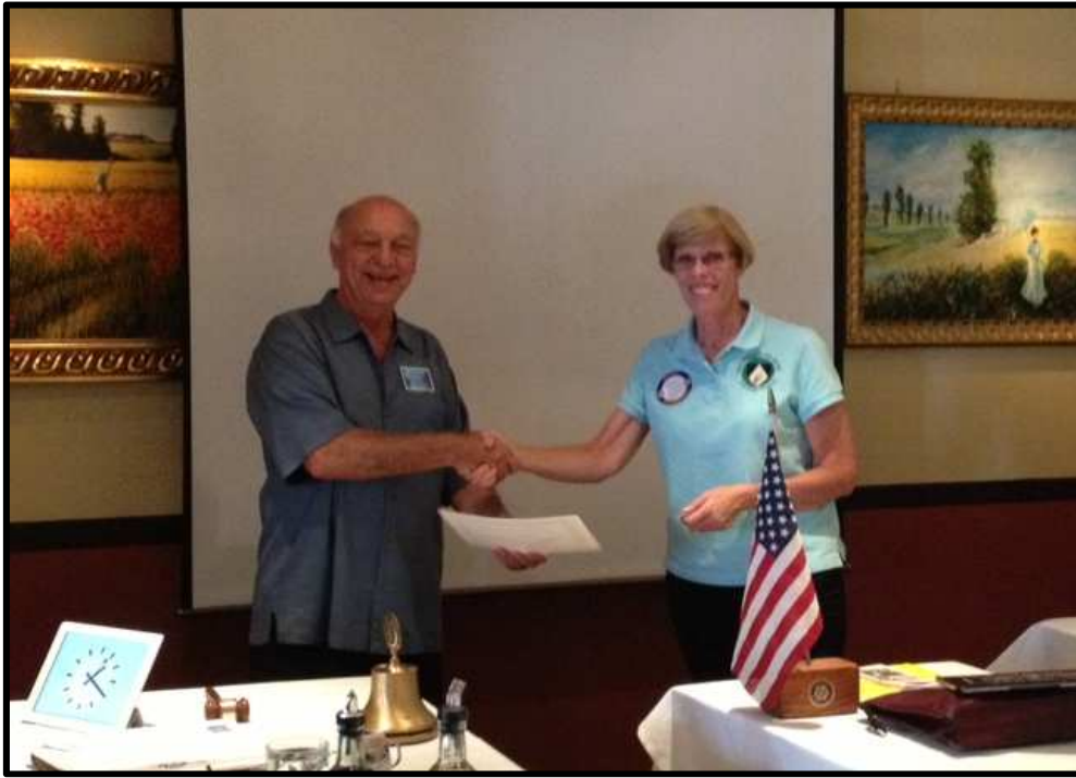
SANTA ANA NORTH ROTARY 1959